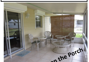
Relax on the Porch