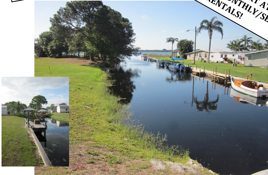
Canal leading to lake!

WEEKLY RATES. THE LONGER YOU STAY, THE BETTER THE DEAL! WEEKLY RATES START AT $650. DISCOUNTS FOR MONTHLY/SEASONAL RENTALS!